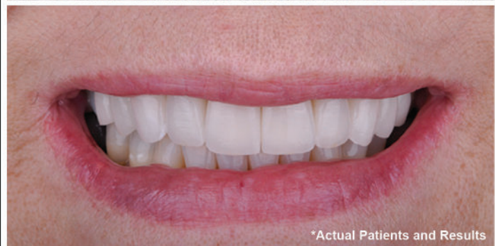
*Actual Patients and Results

HOUR TOPDENTISTS DETROIT 2021, 2022 & 2023