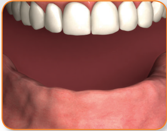
typical patient with missing teeth